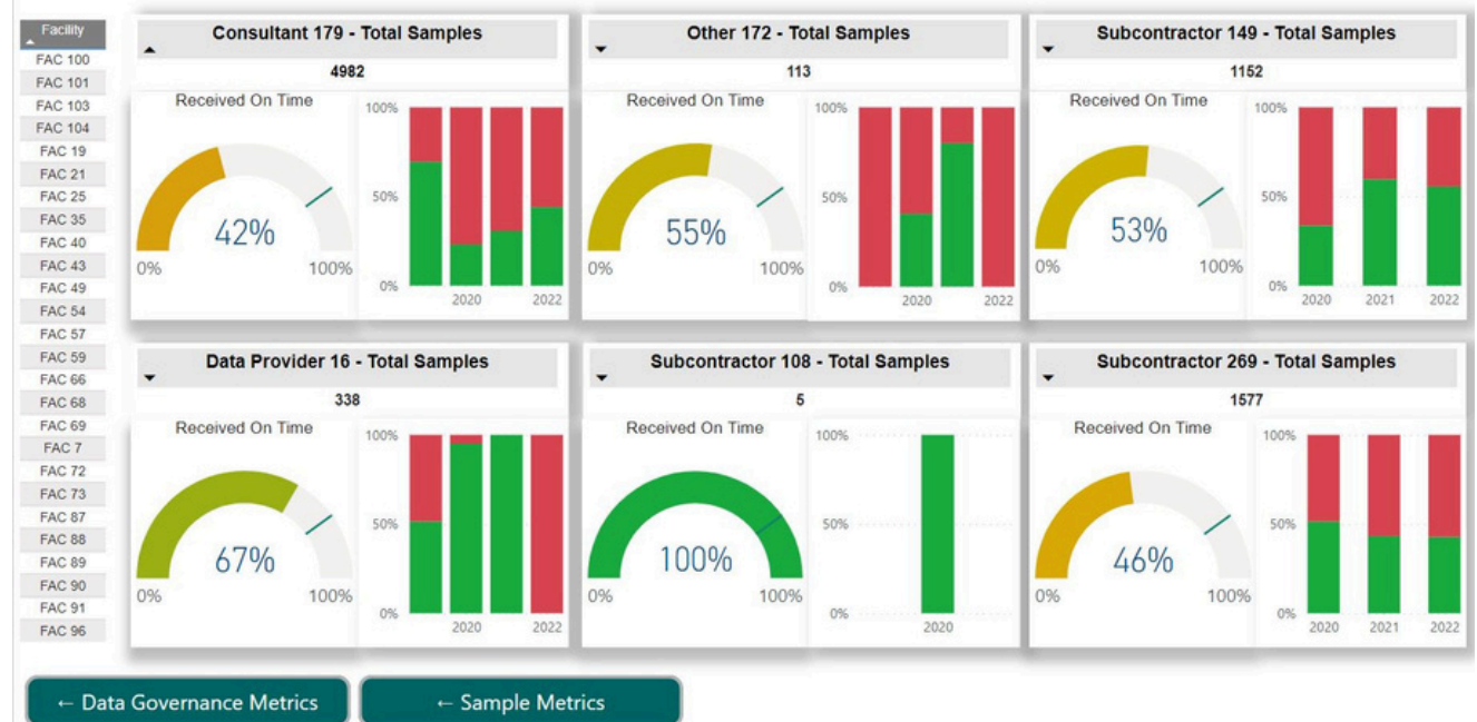
Figure 3. Sample Collection Metrics by Company

An example metrics dashboard is provided for illustrative purposes only.